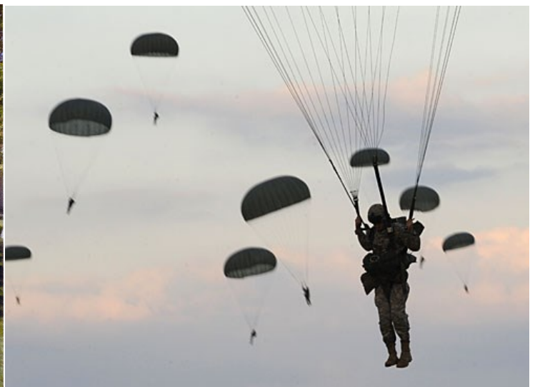
Walking on Air!